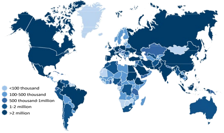
Figure 1: Estimated total number of adults (20-79 years) living with diabetes, 2017

Diabetes estimates have been on the rise for several decades and diabetes is a growing global problem. Some 425 million people worldwide, or 8.8% of adults 20-79 years, are estimated to have diabetes. About 79% live in low-and middle-income countries. If these trends continue, by 2045, 693 million people 18-99 years, or 629 million people 20-79 years, will have diabetes.2